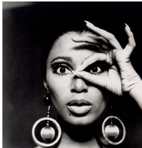
Donyale Luna with earrings, 1966 (Gelatin Silver)